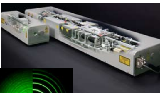
Custom dual cavity TEM 00 laser system for ESPI or holographic PIV.

True TEM 00 lasers are larger and more expensive than an unstable laser giving the same energy. However, for some applications, the TEM 00 laser makes the difference between useful and useless experimental data.